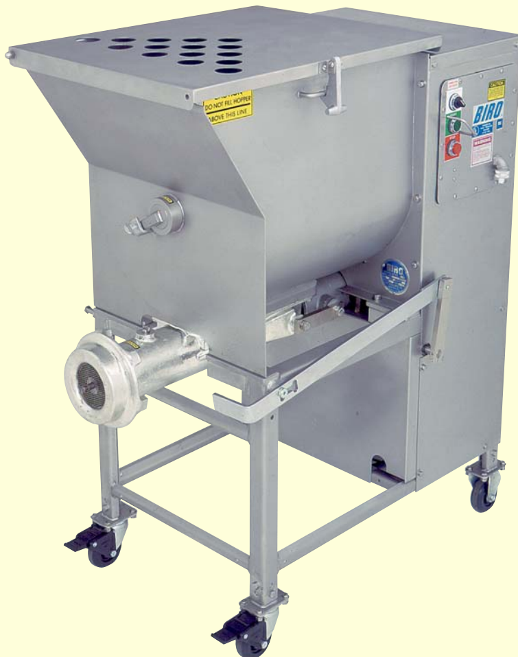
AFMG-24 SHOWN WITH OPTIONAL ADJUSTABLE LEGS WITH CASTERS. ACCEPTS SIZE 32 KNIFE AND PLATE.

The Biro AFMG-24 Mixer Grinder is an ideal mixer grinder for today's compact supermarket meatroom. Its 5hp/3.7 kW (7.5 hp/5.6 kW optional) auger motor, 145 lbs. (66 kg) hopper, and size 32 head can give you an output of up to 65 lbs. (29 kg) per minute for the productivity you need. For even more productivity, your AFMG-24 can come with an optional meat lug holder (see reverse) and an optional electric or pneumatic footswitch. The heavy duty stainless steel hopper, frame, and legs can stand up to years of daily washdown and still resist corrosion, so your mixer grinder lasts longer, and you get a better return on your investment. Of course, it's built with the superior engineering you expect from BIRO.